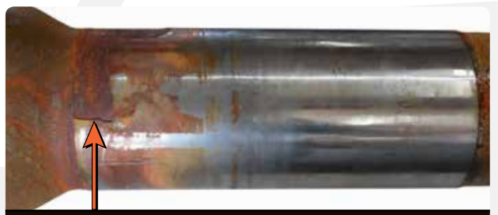
Standard coated spline mandrel. Typical Issue: failure due to chloride attack, causing cracking and chipping