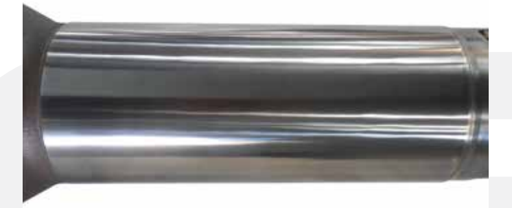
Refurbished mandrel with our CarbideX C9000Cr – a dense, crack-free coating designed to restore carbide coated or chrome-plated mandrels