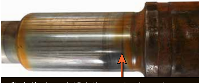
Standard bearing mandrel. Typical Issue: wearing at lower seal